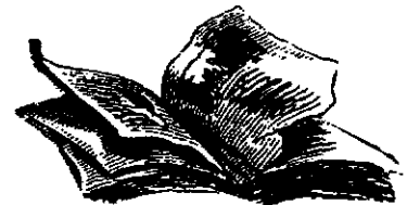
Women in Librartes

The first part of the book critiques theories of adolescent sexual development from various cultural perspectives. Part two examines various issues which impact adolescent development such as AIDS, ethnic issues, and disability. The final part attends to the contexts of female friendships, desirability, sex talk and other differences. This collection is a valuable resource and I, for one, will place it on my class reading list.—D. Granger