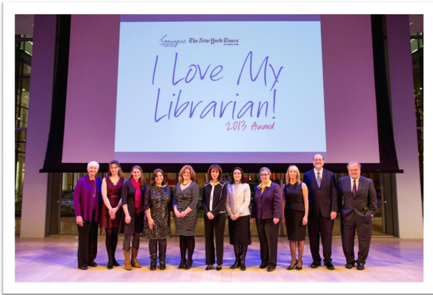
Winners of the 2013 I Love My Librarian Award