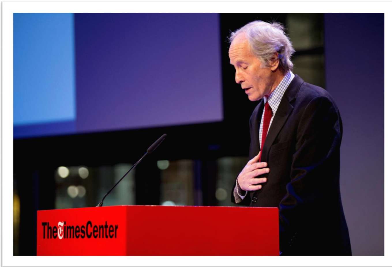
Richard Ford, 2013 winner of the Andrew Carnegie Medal for Excellence in Fiction for “Canada”