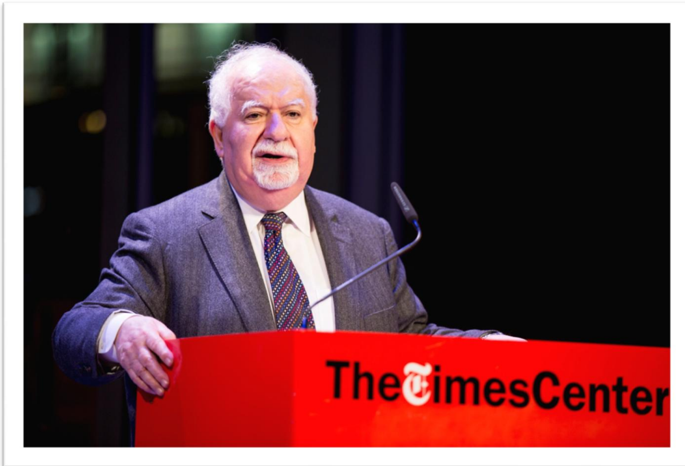
Vartan Gregorian, President of Carnegie Corporation of New York