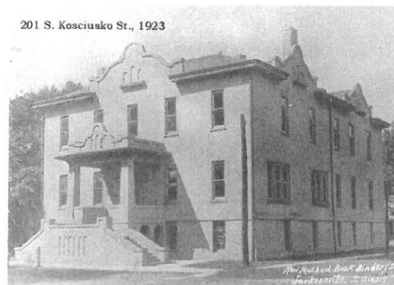
New Method Book Bindery, 1923