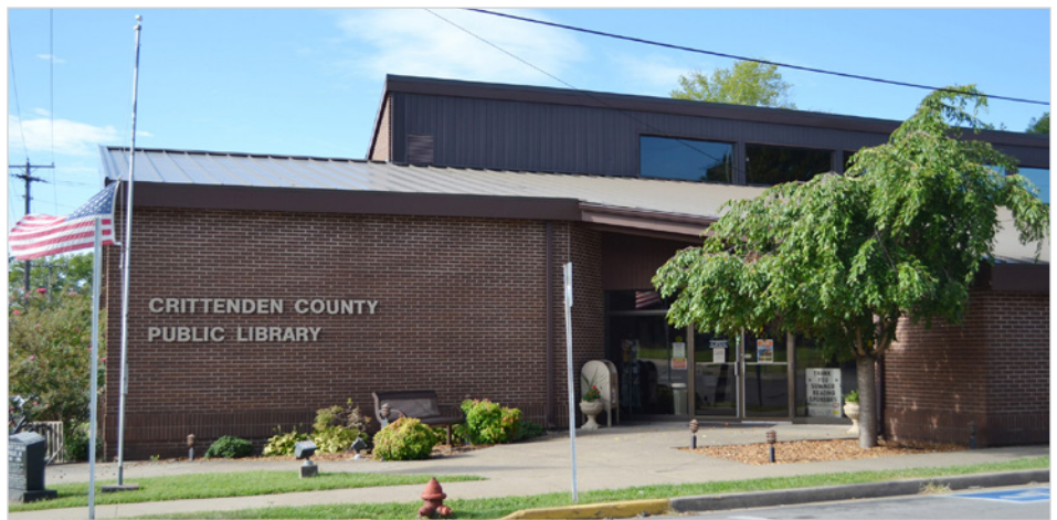
Crittenden County Public Library

these challenges. The library provides access to computers and the internet for jobseekers and has partnered with the local Chamber of Commerce and the employment office to offer resume writing and job search classes. The library also offers weekly technology classes—the only free digital skills classes in the county. In these sessions, community members receive one-on-one aid tailored to their specific technology needs, ranging from email set-up, to job search, to eBook downloads.