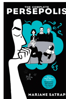
The Complete Persepolis by Marjane Satrapi