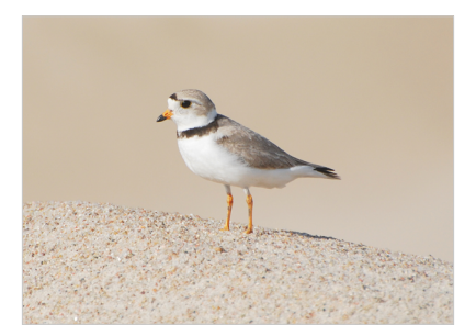
Adult Piping Plover.

On a different note, this is our Student Paper issue. Thanks to all the students who participated and for all the library and information science faculty for nominating papers.