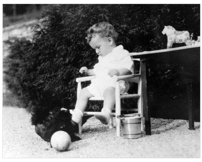
Figure 1. Charles Linbergh Jr., who was kidnapped and murdered by Bruno Hauptmann in 1932.

Around the time of the Lindbergh case, the Bureau also used any federal laws it could to arrest and convict gangsters