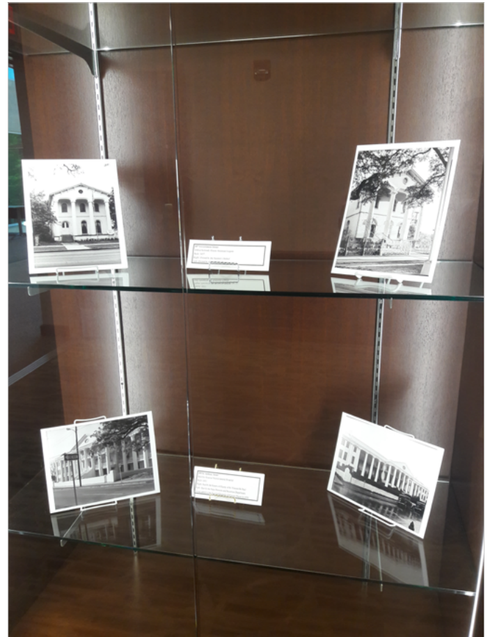
Photograph examples.

The earliest buildings used in this exhibit were built in the aftermath of the 1827 fire that took out nine blocks of downtown Mobile. The Old General Hospital and the Bishop Michael Portier House were among the first buildings to be constructed. While we did not include the Cathedral of Immaculate Conception, Oakleigh, or Spring Hill College because of the lack of photographs in the collections, they too were created after the fire and still stand as a testament to the desire of the architects not to have a repeat of the great fire of 1827. 2 These buildings were a witness to the growth of Mobile in the following decades. The explosion of the cotton trade that began during the 1830s allowed for Mobile to grow and prosper. The thriving docks made both individuals and the city rich, which enabled these buildings to be constructed in such a manner that they would survive fires and hurricanes for decades to come.