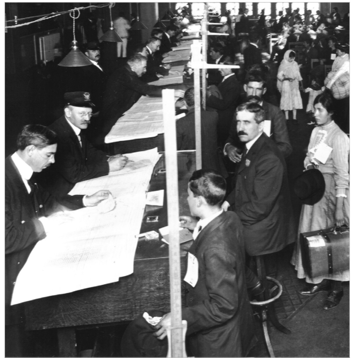
Figure 1. Registry clerks at Ellis Island

After all the tickets for a particular voyage had been sold and the manifest was complete, it was turned over to the ship's captain. On departure day, crew members checked people's names against the list as they came on board. The crew allowed past them only those people whose names were on the list, i.e., those who had paid for a ticket. If a person had paid but did not board, then their name was crossed out on the manifest. If someone was transferred to the vessel after the official manifest had been handed to the captain, that name was added to the list. If a passenger died en route, a notation was made. Thus the captain had an accurate, up-to-date list of who was on board when the ship left its home port and who was on board when it docked at the end of the journey. 8 Captains were required by the 1819 Steerage Act to sign a statement printed on the manifest verifying that the names on each list matched the names of those people disembarking. 9 Any discrepancies resulted in fines for the shipping company. Thus it was in the shipping