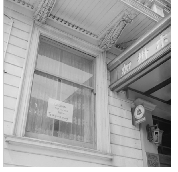
Dorothea Lange, "San Francisco, California. A home is sought for kittens as owners prepare to evacuate. Evacuees of Japanese ancestry will housed in War Relocation Authoritry centers for the duration," Records of the War Relocation Authority, 1941–1989, https://catalog.archives.gov/id/536470.

I am not arguing here that the intellectual content of government information is fundamentally suspect and untrustworthy. Rather, the opposite: the political nature of its creation casts a shadow that deepens what we can discern from the document. With a photograph, we can consider and evaluate the aesthetic and narrative qualities that resulted from deliberate decisions and lucky happenstances on the part of the photographer. With a government document, we can identify latent characteristics that make visible the political context for the creation of that publication, website, video, or social media posting.