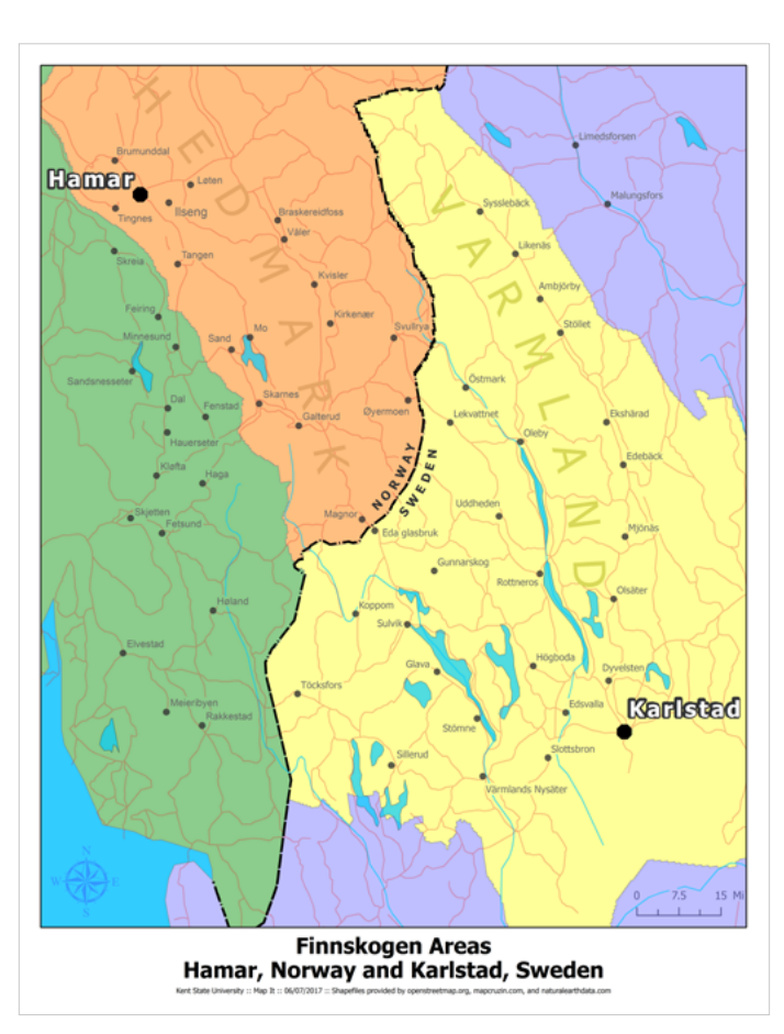
Figure 1. Finnskogen Areas: Hamar, Norway, and Karlstad, Sweden

Today, Forest Finns are one of five officially recognized ethnic/linguistic minorities in Norway and Sweden.<sup>5</sup> The two countries began to offer national minority status to Forest Finns and other historically persecuted minorities only in the 1990s, following adoption of the United Nations' Declaration on the