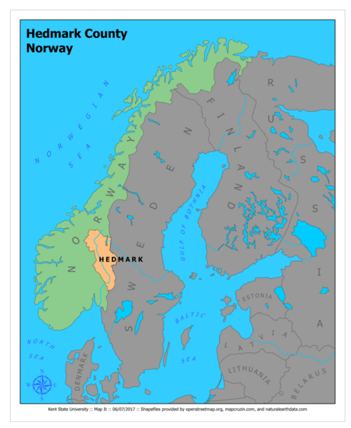
Figure 2. Hedmark County, Norway

the state's interests (i.e., tourism services) or that was written in the minority language and provides the direct voice of members of the minority group. In an age of e-government, when information is increasingly accessible only via electronic means, governments that legally require their citizens to use electronic means to access services have an obligation to prevent the loss of digital access to newly-created cultural heritage materials and to digitize older materials. One of the measures of how invested a government is in making information available to linguistic minorities can arguably be whether that government provides the same information in the minority language as it does in the dominant language for its primary communications vehicles. As Segovia, Jennex, and Beatty discovered, full parity in website translation can increase the trust that members of a bilingual population feel toward their government, a sentiment that would seem of even greater importance when there has been a history of linguistic persecution. Similarly, one can get a sense of how invested a community is in providing access to government services for linguistic minorities by whether information is available at libraries and archives in the minority language.