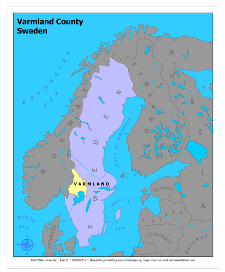
Figure 3. Varmland County, Sweden

As table 1 shows, the website for Sweden's National Archives presents descriptive information in three languages.