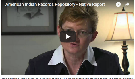
This YouTube video gives an overview of the AIRR, an underground storage facility in Lenexa, Kansa

The LOC recently provided the above video that presents information on FEDLINK's AILI, Here you will find a panel of American Indian historians and cultural experts talking about regional and federal culture and history and be given a demonstration of the Indigenous Tribal Law Project, a free, online resource to increase access and discoverability of tribal law through tribal listings, websites, and online primary source materials.