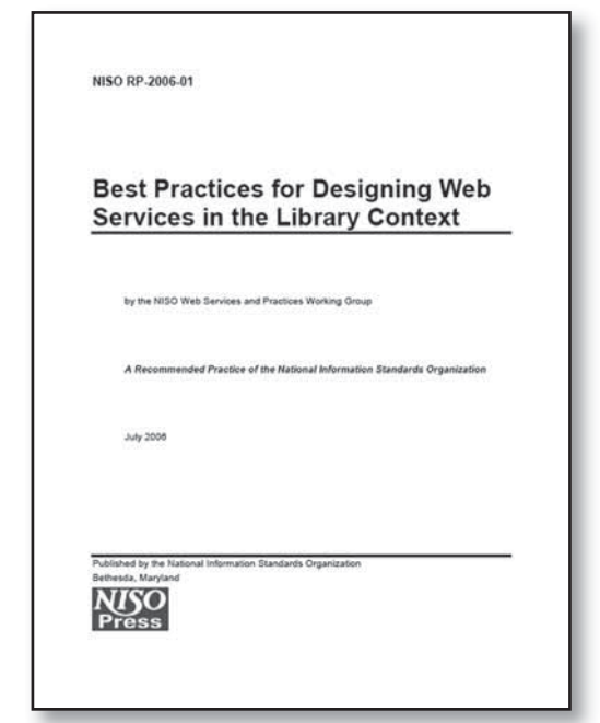
The PDF of Best Practices for Designing Web Services in the Library Context , published by NISO Press in July 2006, is available at www.niso.org/standards/resources/rp-2006-01.pdf.

Appendix A contains a useful categorization (with examples) of Web services. Discovery services, for example, are used to discover metadata, full objects, or services. Locate services are used to "resolve an object to its location, either physically or in a process." Requesting services are used primarily to request information and information objects. Delivery services facilitate the "delivery of objects, information, formatting, transactional information, etc." What the working group calls