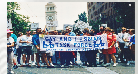
Above: Gay and Lesbian Task Force marching in the 1992 San Francisco Pride March.