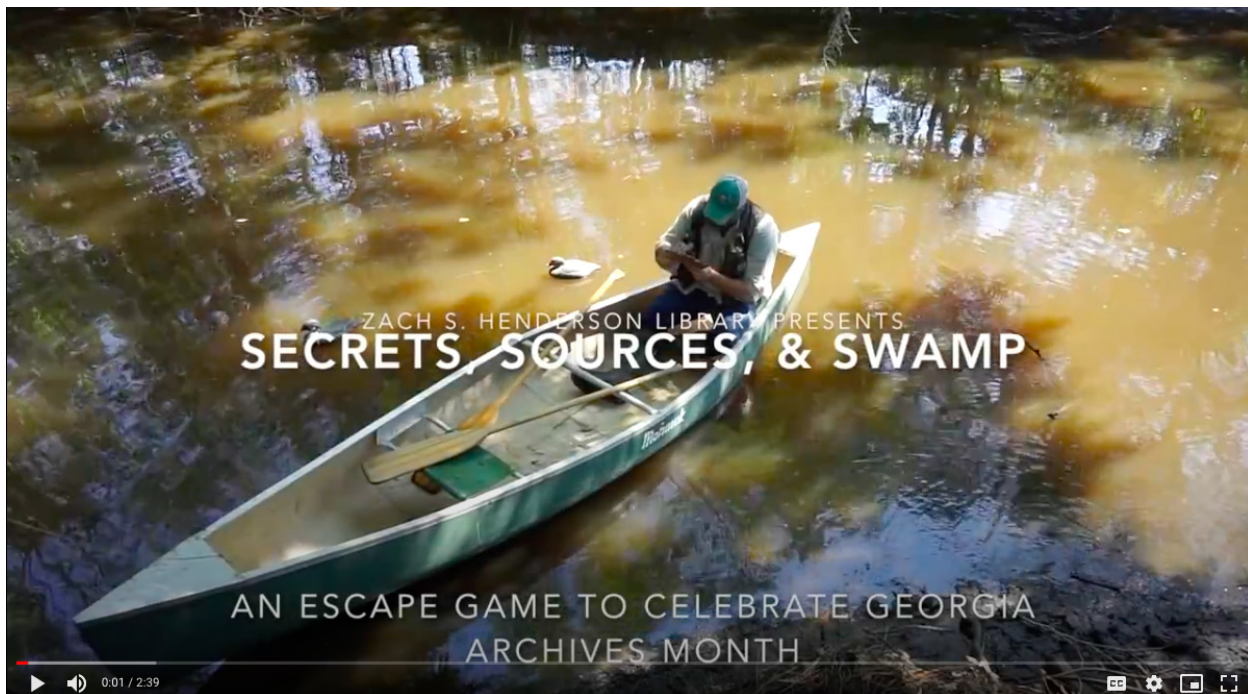
Figure 3. Screen Capture of Introductory Video

Working in groups of 4-8, participants were welcomed to the game and safety rules by a “Game Master” similarly to commercial, live-action escape games. The role of Game Master was performed by a scripted faculty librarian. This was the first opportunity participants could ask the librarian questions about the overall game and purpose. The Game Master then played a 5-minute introductory video that acclimated participants to the game and central task.