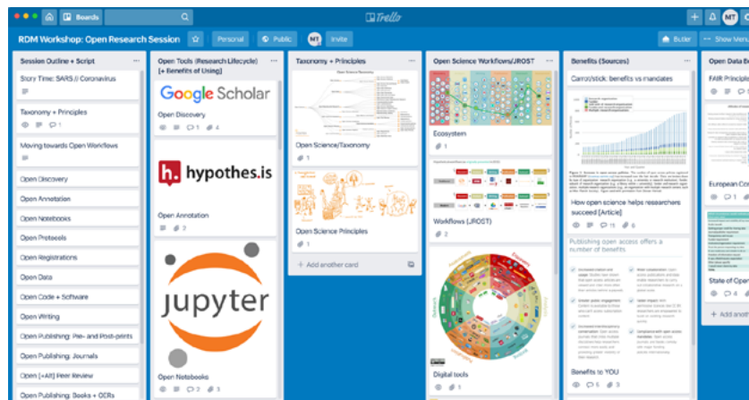
Meghan's Open Science Practices Trello Board

Trello is a free web-based application that uses a corkboard style layout to organize to-do lists and manage team-based projects. The easily manipulated columns and cards, as well as the ability to add links and attach files and images, make Trello an ideal tool for gathering ideas, quotes, and references then organizing them into a presentation or paper.