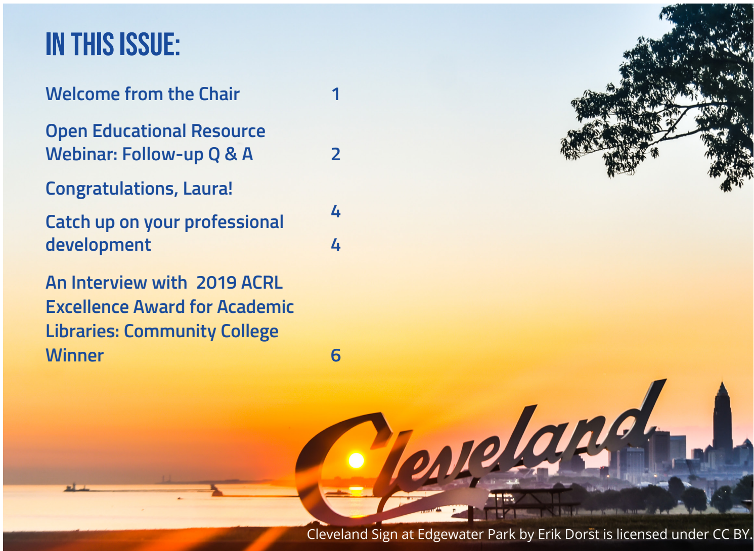
Cleveland Sign at Edgewater Park

An Interview with 2019 ACRL Excellence Award for Academic Libraries: Community College Winner 6