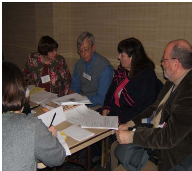
LTA Education Committee Prepares Action Plan