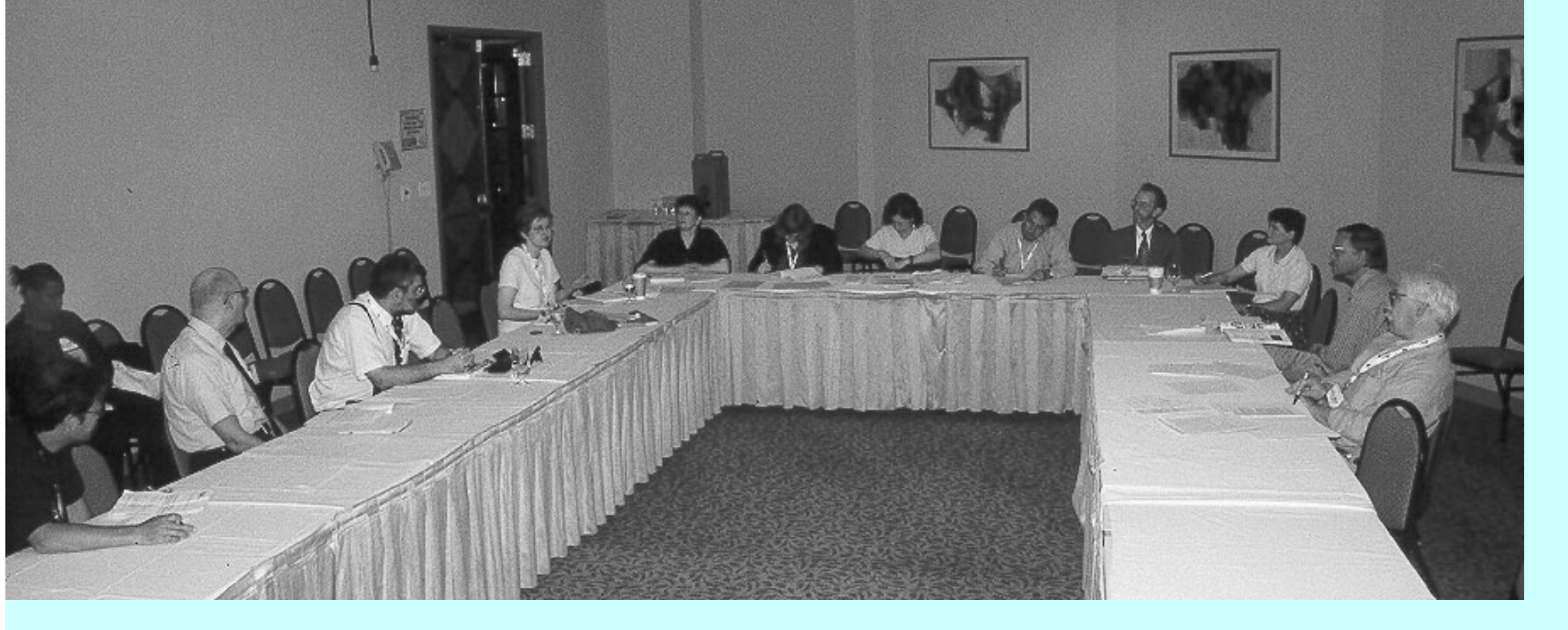
The first MAGERT Executive Board meeting at the ALA Annual Conference in Chicago. The meeting is open to everyone.

The ALA Core Values Task Force, which sent a representative to the Midwinter meeting, has revised the draft based on the input received. The fifth draft of the Core Values is available on the web at <a href="https://www.ala.org/congress/corevalues/draft5.html">www.ala.org/congress/corevalues/draft5.html</a>