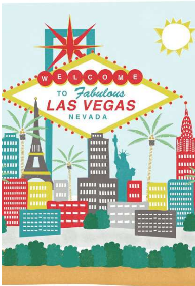
Las Vegas, Nevada