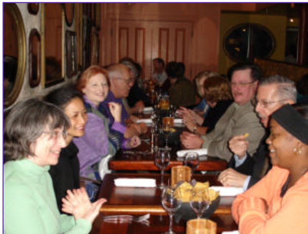
Colleague dinner at Boudros.